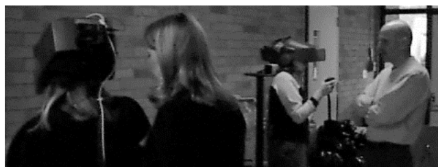
Figure 1. Observing students interacting while in GCW

Currently, very little is known about collaborative learning processes using VLEs [30]. Over the coming years, however, everyday educational practices can be expected to rely increasingly upon collaboration and interaction within these kinds of learning environments [17]. Collaborative learning exercises are valuable because they help students clarify ideas and concepts through processes of articulation and discussion [26]. In requiring that learners invest significant mental effort, collaboration supports active learning and deep processing of information [2]. Newman, Johnson, Webb, & Cochran [21] compared face-to-face collaborative activities with computer supported collaboration and concluded that face-to-face interaction was better for creative problem exploration and idea generation while computer-based conferencing was better for linking ideas, interpretation, and problem integration. It is conceivable that the virtual face-to-face nature of VLEs may provide unique collaborative experiences that draw upon the best attributes of both face-to-face and computer-based collaboration.