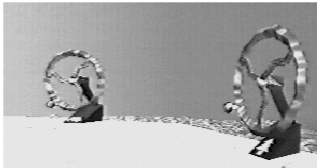
Figure 4. Two of the global variable wheels of GCW

car is at the base of each wheel to clearly identify the variable to be adjusted. Using the simple metaphor of a wheel to represent complex phenomena is beneficial in that it allows students to focus on the process of global change as it progresses over time. Using their cyber hand, students can hold on to and rotate wheels clockwise to increase the amount of a variable in the world and counterclockwise to decrease the amount. The current value of the wheel selected is displayed in a pop-up box in their display and changes continuously as the wheel is rotated.